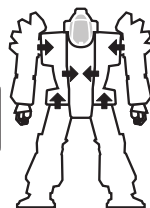
Damage Transfer Diagram